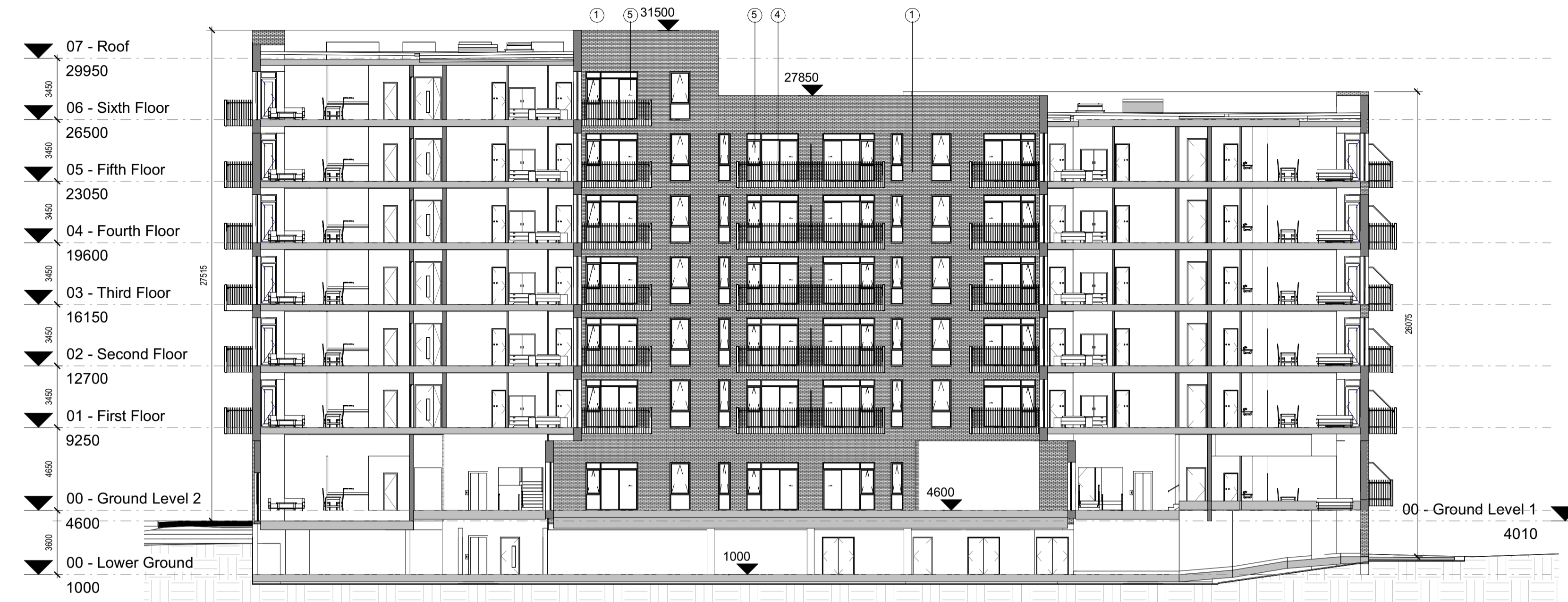
1 Block 2 - Section E-E 1 : 200

NOTE ALL DIMENSIONS TO BE CHECKED ON SITE NO DIMENSIONS TO BE SCALED FROM THIS DRAWING THIS DRAWING IS TO BE READ IN CONJUNCTION WITH RELEVANT CONSULTANTS DRAWINGS