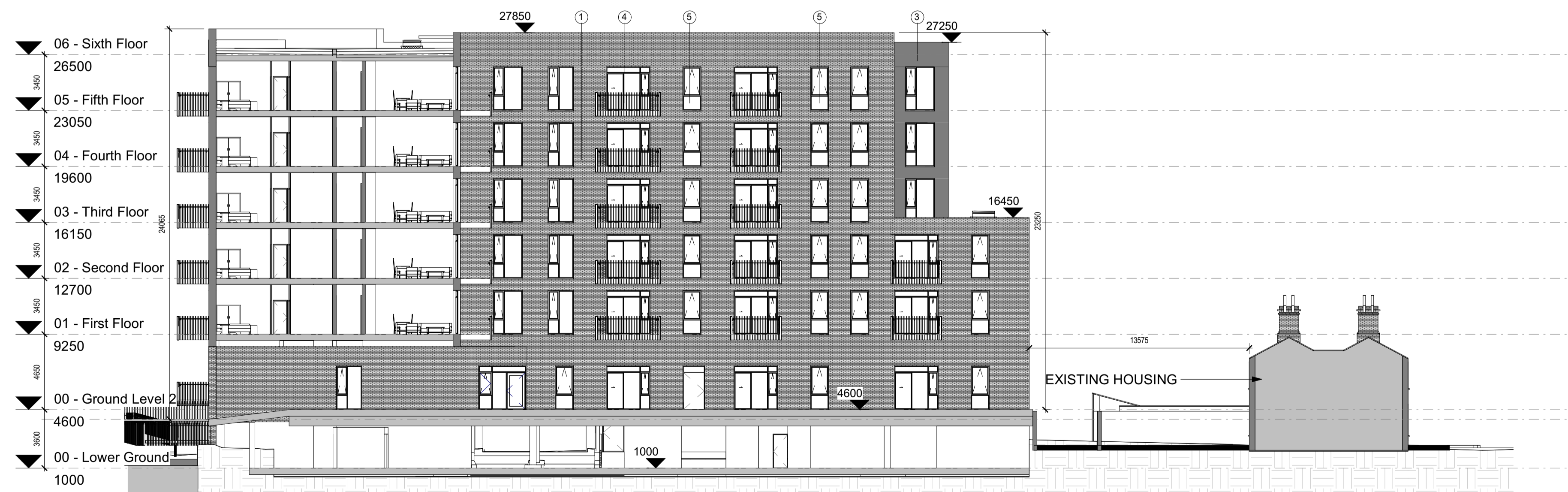
2 Block 2 - Section F-F 1 : 200

DRAWING ISSUED FOR PLANNING APPLICATION NUMBER: DSDZ4279/18 GRANTED: 18/12/2018